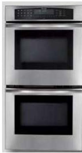
C272 and C302