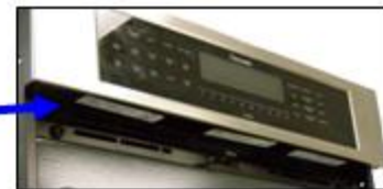
Model and Serial Number Location