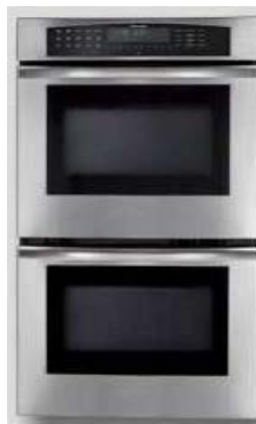
SEC,SECD 272 and 302