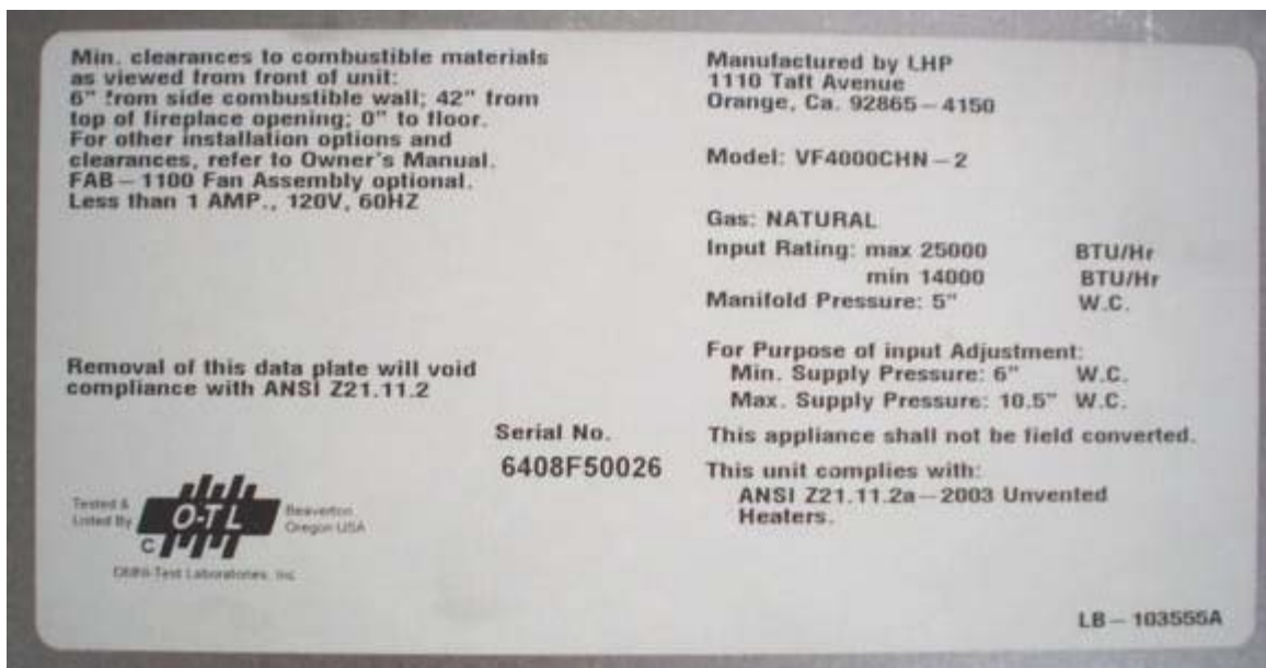
Sample Fireplace Rating Plate