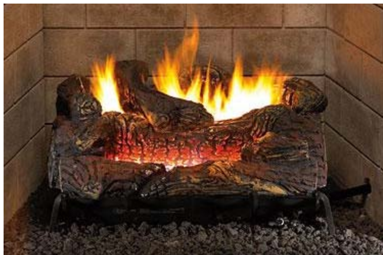
VFGL Log Set

Consumer Contact: For additional information, please contact Lennox Hearth Products at (800) 826-8546 between 8 a.m. and 4 p.m. CT Monday through Friday, or visit the firm's Web site at http://www.lennoxhearthproducts.com