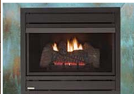
VF4000, VF5000 & VF6000 Fireplaces