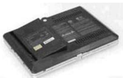
Bottom of TF-DVD 1020 unit showing placement of battery